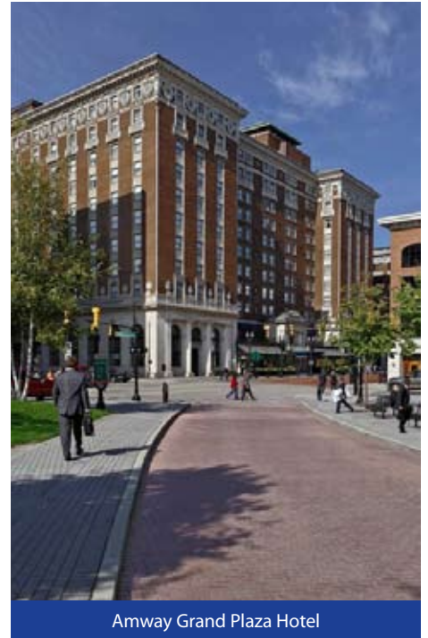
Amway Grand Plaza Hotel